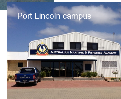
Port Lincoln campus