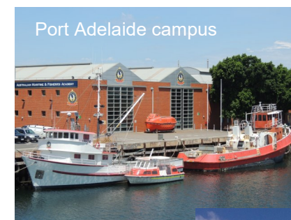
Port Adelaide campus